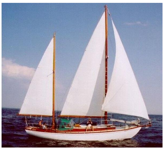
A ketch similar to "AMANDA"

there were many fewer power boats and yachts were a more sensible size, most being in the 20 or 30 ft range Bluebirds, Dragons, Jubilees, that sort of thing.