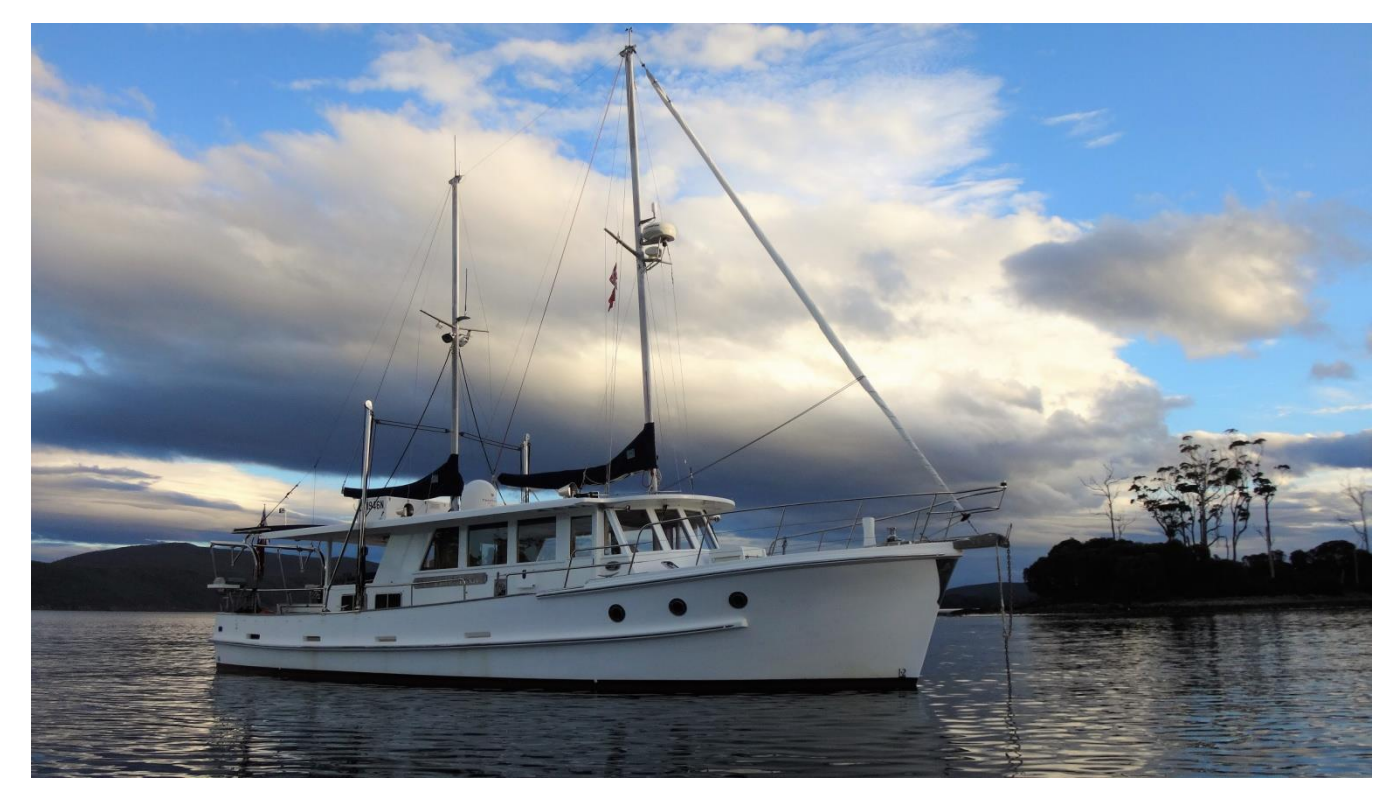
FLEMINGO MOORED AT PORT ARTHUR.

THIS EDITION OF COMPASS ROSE HAS A DECIDEDLY TASMANIAN FLAVOUR